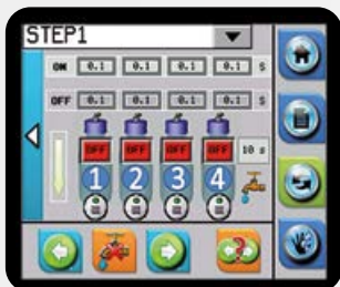
DISTRILAM dosing unit programming integrated to the machine's commands in the full range of MASTERLAM® machines.

MASTERLAM® 1.1 Large diameter, automatic polishing machine with central pressure and motorised oscillating head