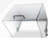
60 MLEP1 00