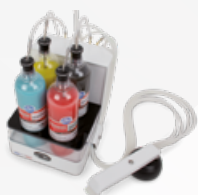
60 MLD00 00