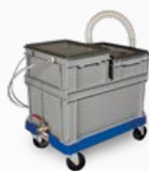
60 A0029 00